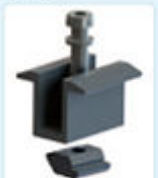
中压块、内六角螺栓、弹簧垫圈、滑块螺母 Medium pressure block, six hexagon bolt/spring washer, nut slide