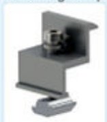
边压块、内六角螺栓、弹簧垫圈、滑块螺母 Edge pressing block, six hexagon bolt/spring washer, nut slide