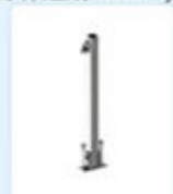
U型底座、方管、L型连接件、平弹垫、滑块螺母、内六角螺栓 U type base, square tube, L type connector, slider nut, inner six angle bolt, flat elastic pad