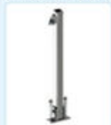
U型底座、方管、L型连接件、平弹垫、滑块螺母、内六角螺栓 U type base, square tube, L type connector, slider nut, inner six angle bolt, flat elastic pad