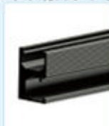
导轨 load rail

本系统由以下零部件组成/This system consists of the following components: